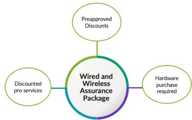
Figure 3: Key Features of Juniper Packaged EA for Mist Wired and Wireless Assurance

Juniper also offers a simplified Packaged Enterprise Agreement (Figure 3) for Juniper Mist™ Wired and Wireless Assurance.