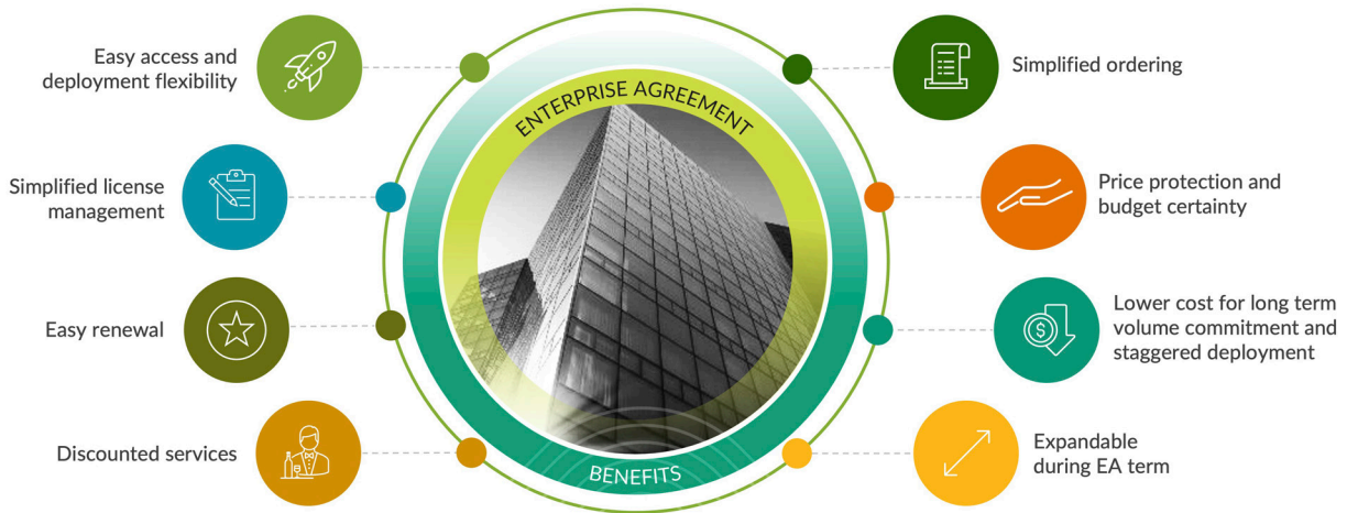
Figure 1: Juniper Enterprise Agreement Benefits

Juniper currently has two EA offers available to all customers: Custom EA and Packaged EA.