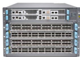
PTX10004 Packet Transport Router