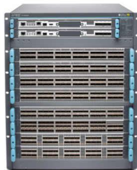
PTX10008 Packet Transport Router